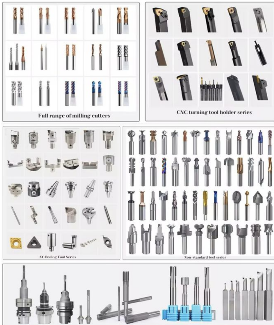
Full range of milling cutters