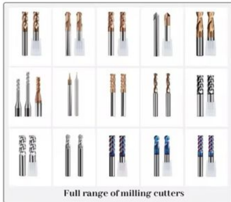
Full range of milling cutters