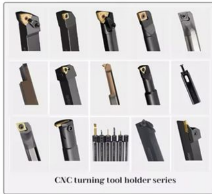
CNC turning tool holder series