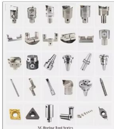
NC Boring Tool Series