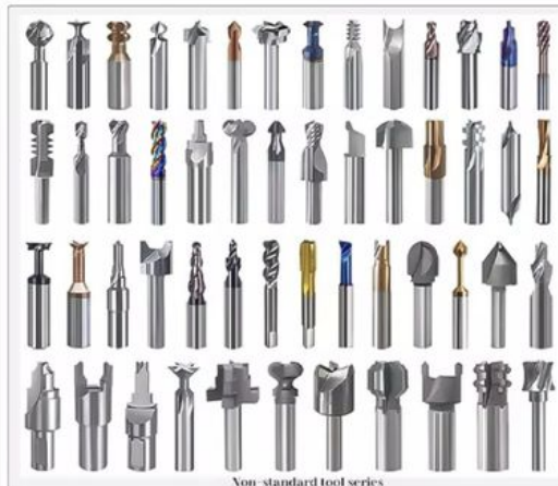
Non-standard tool series