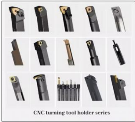
CNC turning tool holder series