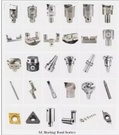
NC Boring Tool Series