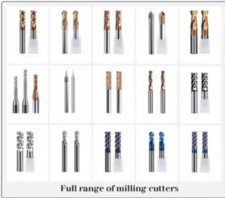
Full range of milling cutters