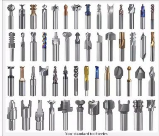
Non-standard tool series