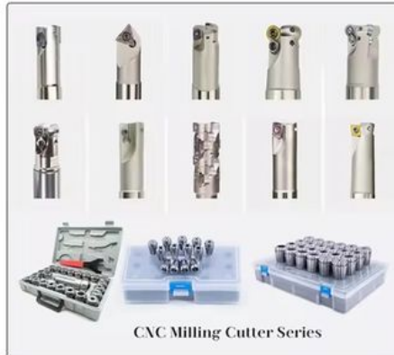
CNC Milling Cutter Series