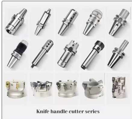
Knife handle cutter series