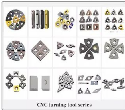
CNC turning tool series

For more product details, please contact us