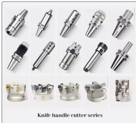
Knife handle cutter series