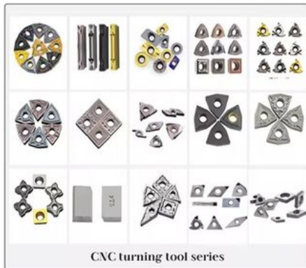
CNC turning tool series

For more product details, please contact us