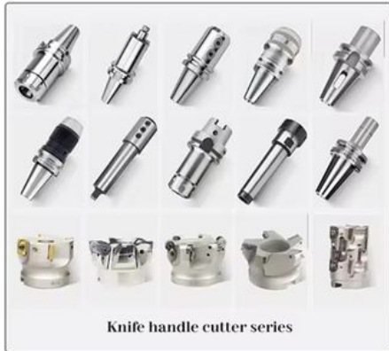
Knife handle cutter series